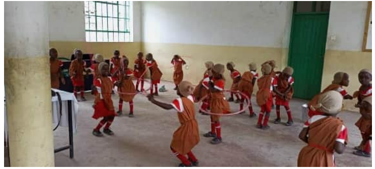
NAKURU COUNTY REGIONAL MUSIC FESTIVALS WE EMERGE TO BE NUMBER 1