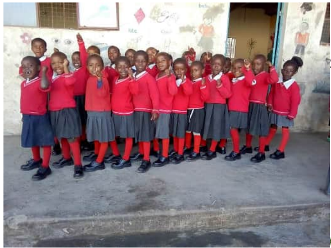
Happy Learners posing for a picture with their new Uniforms