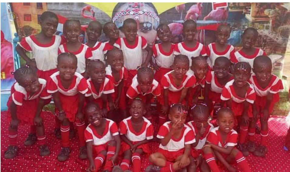
COUNTY MUSIC FESTIVALS AT KISUMU