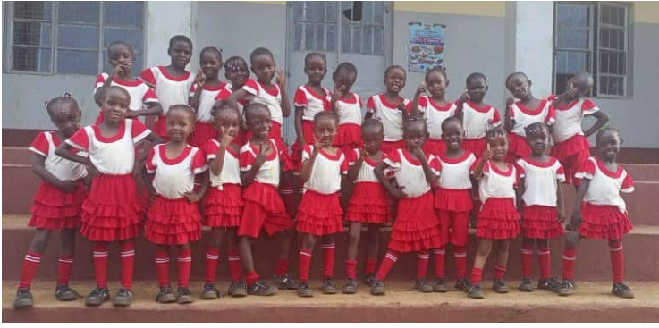
COUNTY MUSIC FESTIVALS WE EMERGE TO BE NUMBER 1