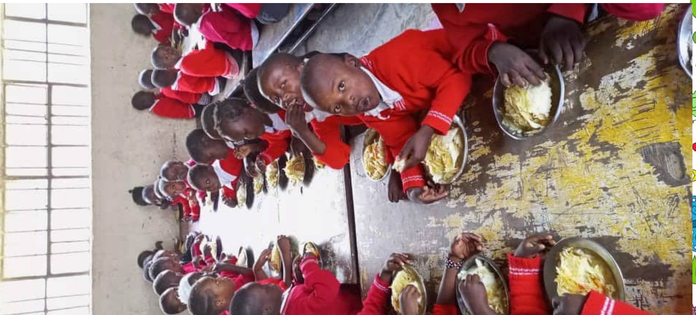
During Lunch Time