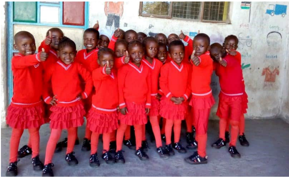
Singing game group 2018