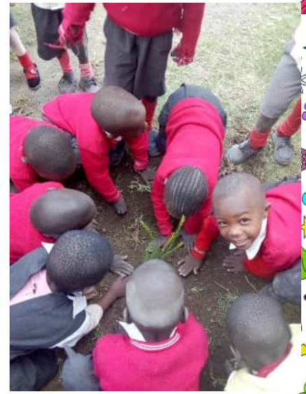
During Environmental Day and Tree Planting Exercise