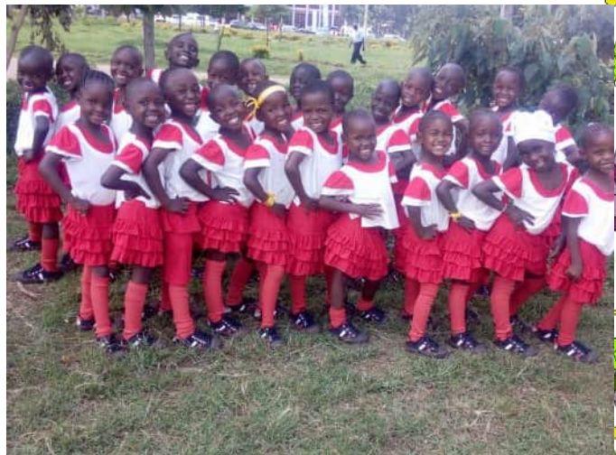
During Music Festivals