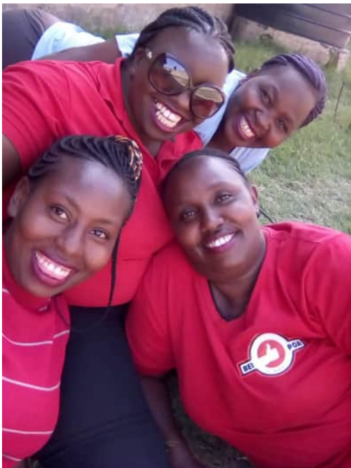
Teaching Staff during a school Trip