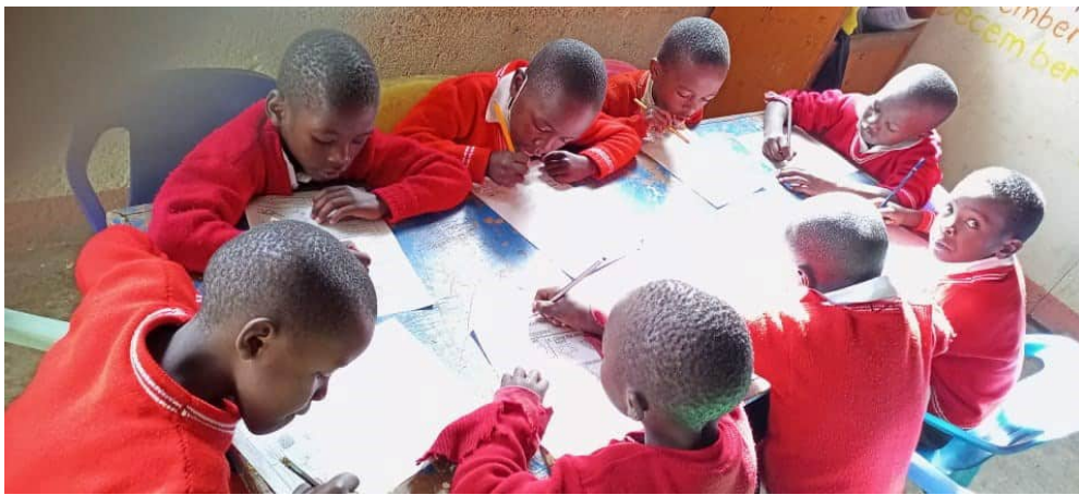
PP2—2021 doing their exams