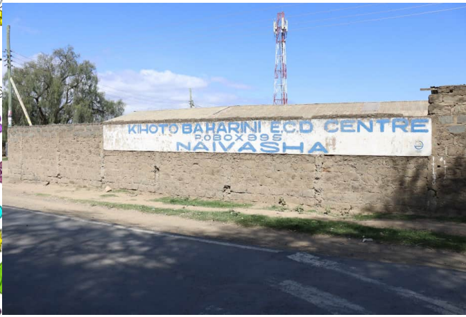
School Name and Address before renovation