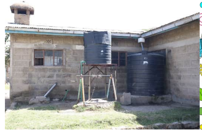
Water Tanks Next to Kitchen