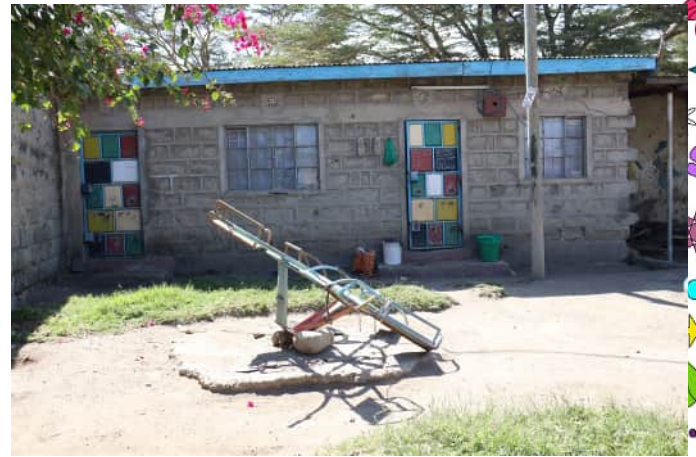
Teaching Staffs rooms