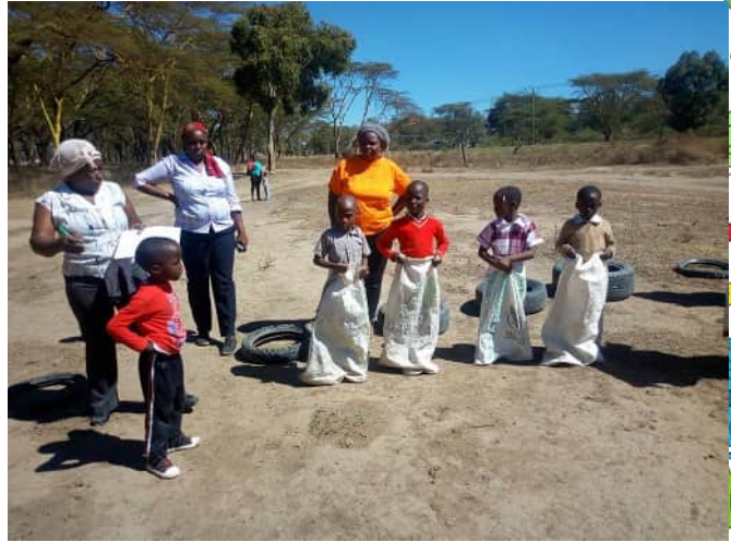
Games time at Kihoto Playgrounds