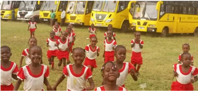
COUNTY MUSIC FESTIVALS AT KISUMU