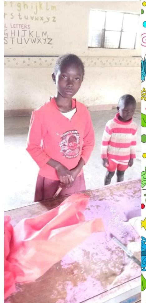
Pictures of Parents and learners receiving food packs and clothes distribution