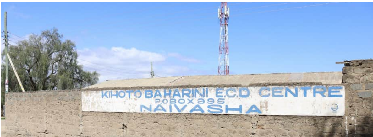
Our School Name and Addresses before renovation