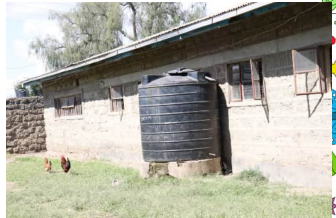
Water Tank Behind Dinning hall