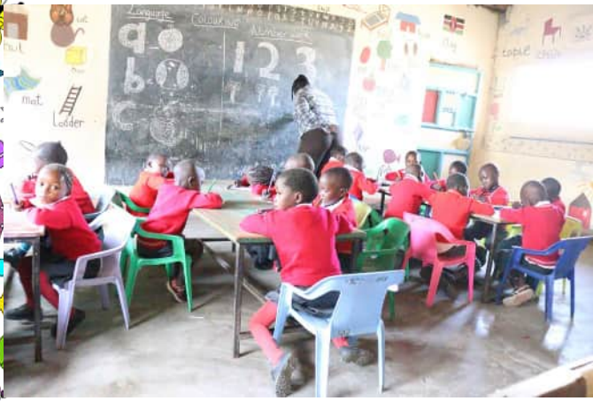
PP1 CLASS WITH TR. FLORENCE