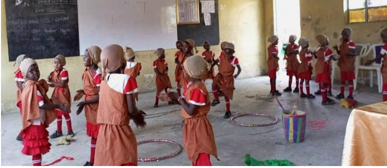
COUNTY MUSIC FESTIVALS WE EMERGE TO BE NUMBER 1