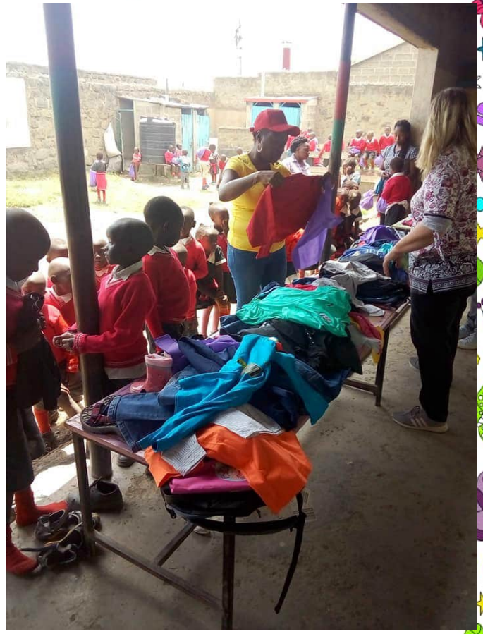
Pictures of Parents and learners receiving food packs and clothes distribution