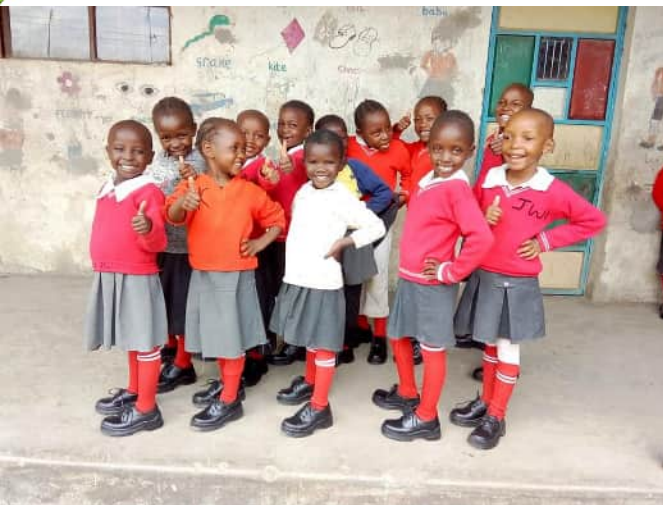
Happy Learners posing for a picture with their new Uniforms