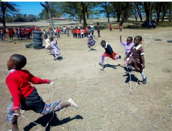
Games times at Kihoto Playgrounds