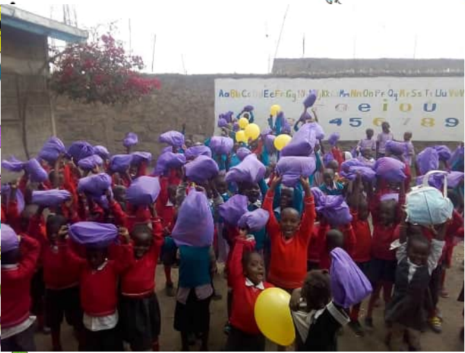
Christmas Food Packets