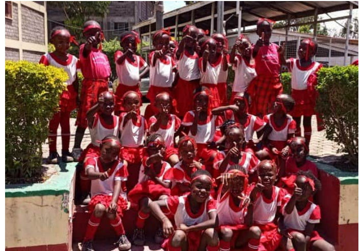
NATIONAL MUSIC FESTIVALS WE EMERGE TO BE NUMBER 4 NATIONAL WIDE