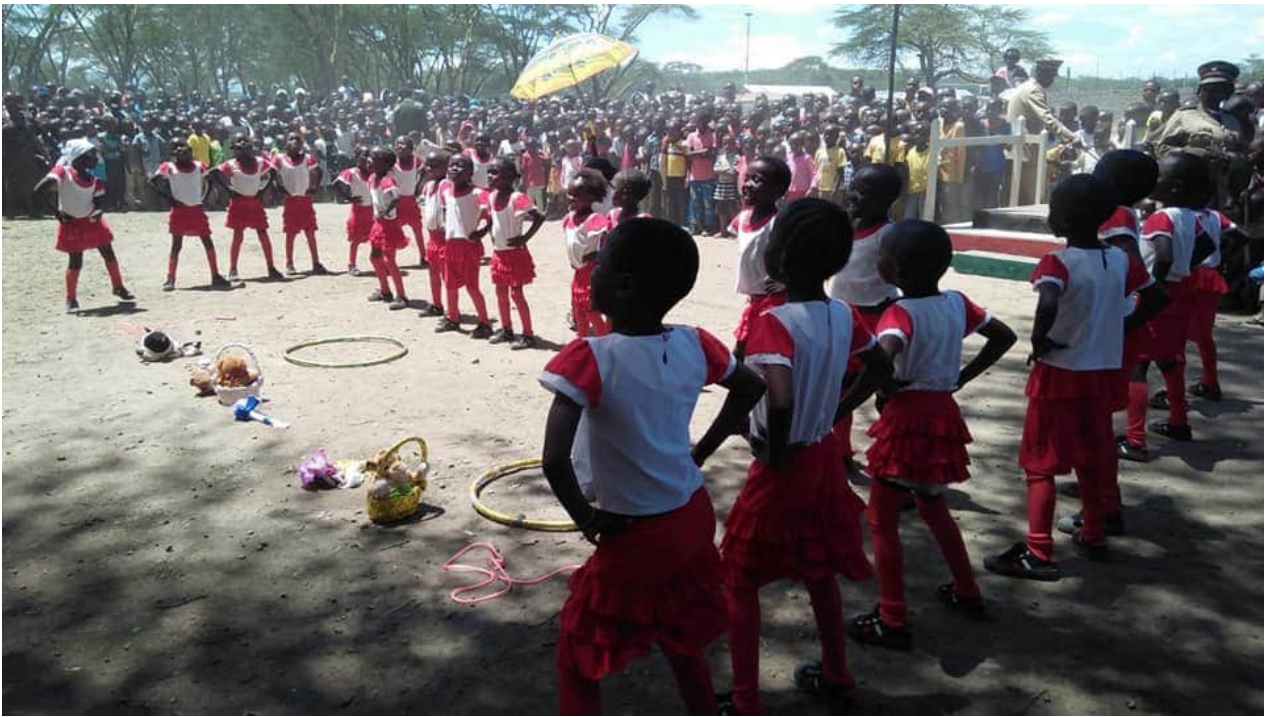
During Music festivals