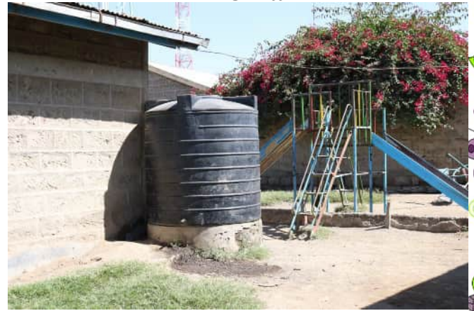
Water Tank near staff rooms