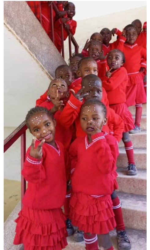
COUNTY MUSIC FESTIVALS AT KISUMU