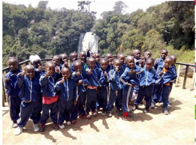
Trip day at Thompson Falls